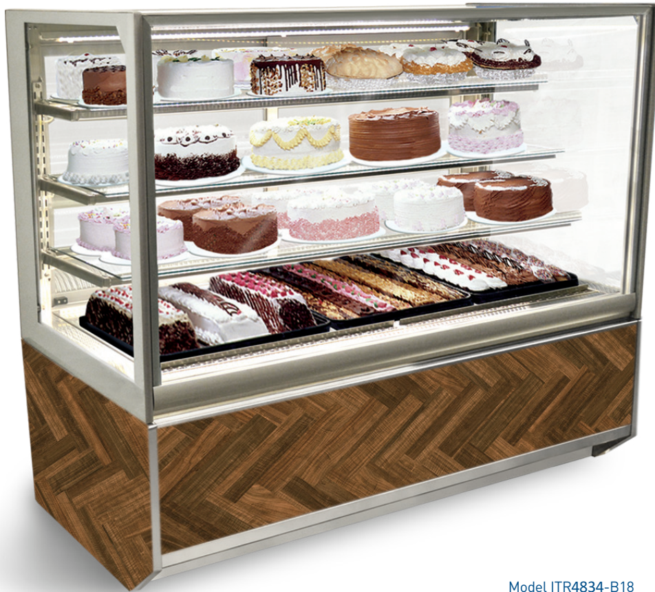
Model ITR4834-B18 Shown with optional laminate

Designed for customers looking for rich, up-scale Italian styling for maximum visual appeal that will drive product sales.