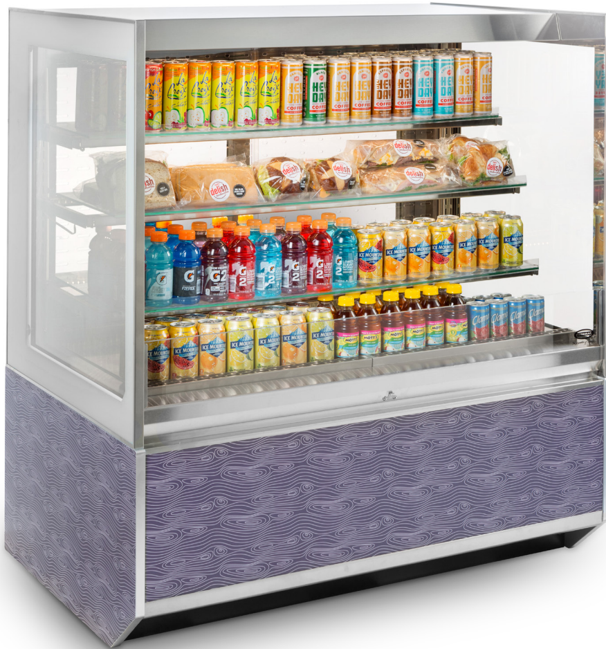
Model ITRSS4834-B18 Shown with optional laminate

Designed for customers looking for a rich, up-scale Italian styling for maximum visual appeal that will drive product sales.