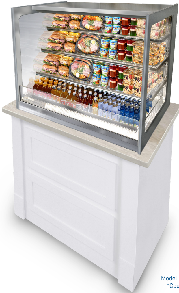
Model ITRSS3634 Shown *Counter Not Provided

Designed for customers looking for rich, up-scale Italian styling for maximum visual appeal that will drive product sales.