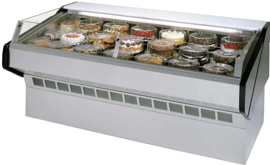
Panel base shown.

Market Bakery. The low profile merchandiser that provides solutions to your merchandising needs. Designed for continuous case line-ups.