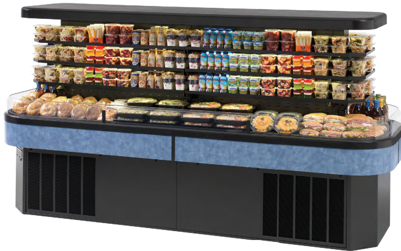
Model IMSS120SC-3 Shown