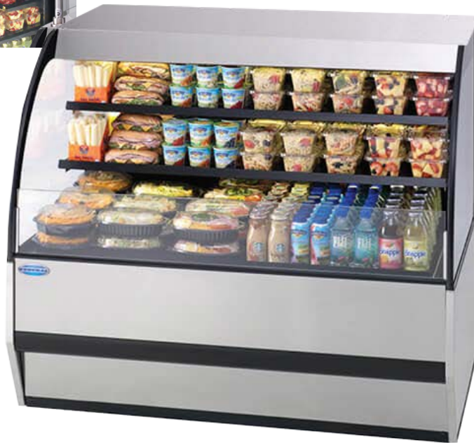
Model SSRVS5942 Shown