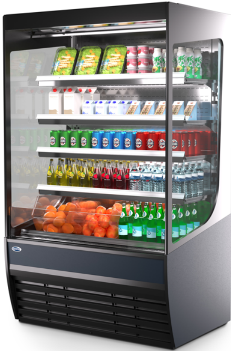
Model VFSS3678S shown

Maximize limited space and expand your menu offering with the ability to "flex" between heated, refrigerated, or ambient food and beverages using a single 78"H 3-in-1 grab-and-go multifunctional merchandiser.