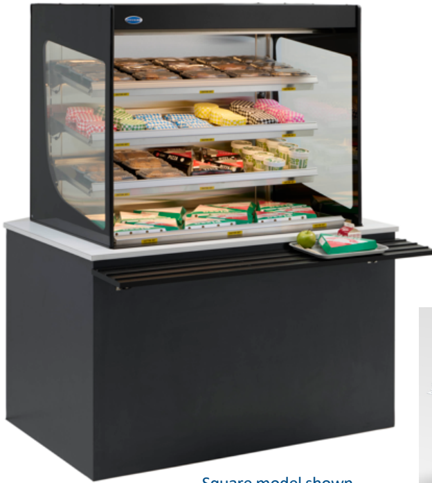
Square model shown

Designed with impulse sales in mind. Get maximum return from an attention-grabbing case and increase profits.