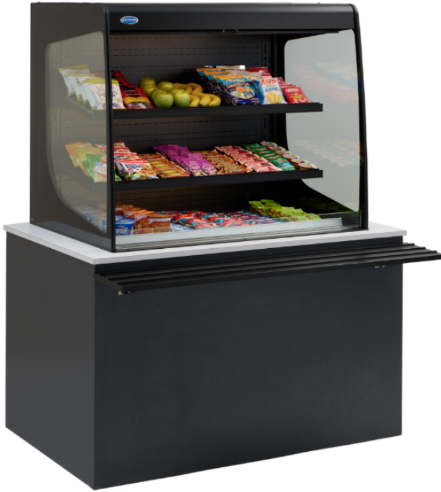
Square model shown

Designed with impulse sales in mind. Get maximum return from an attention-grabbing case and increase profits.