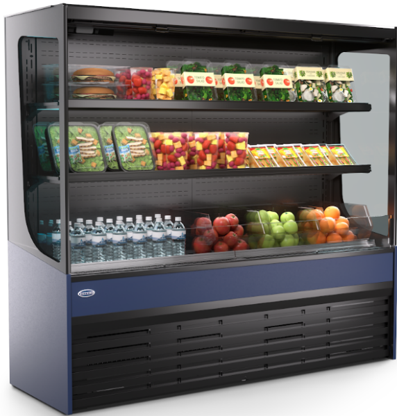
Model VRSL7260S Shown with Options

Designed to help you make the most of your limited space with a slim 24" depth while delivering a bold, attention-grabbing design that highlights your merchandise.