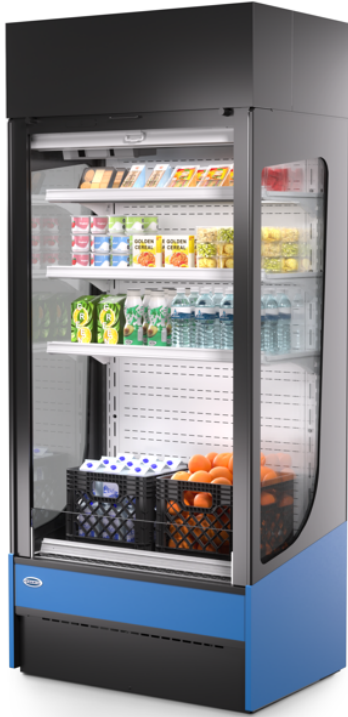
Model VRSL3683S-MLK Shown with Options

Designed with school nutrition in mind, the Milk Display Case enhances accessibility, visibility, and security. It ensures that students can easily access fresh milk and other cold products.