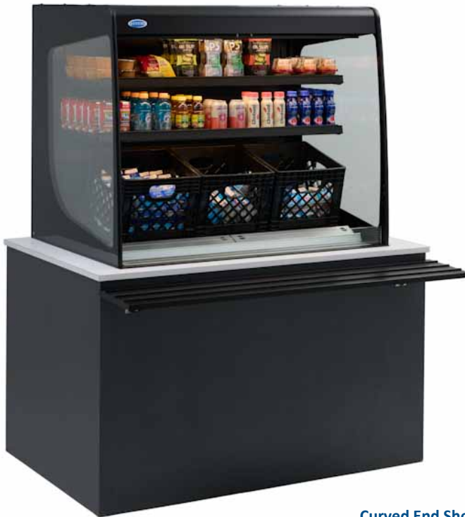
Curved End Shown

Designed with impulse sales in mind. Get maximum return from an attention-grabbing merchandiser and increase profits.