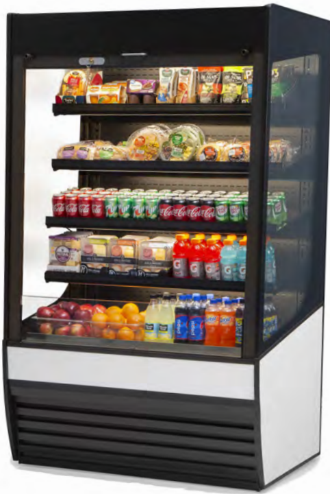
Model VRSS4878S Shown with Options

Designed with impulse sales in mind. Get maximum return from an attention-grabbing merchandiser and increase profits.